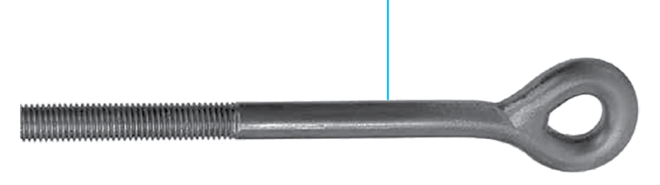
Fig. 278L: Left Hand Threads

Fig. 278: (Formerly Afcon Fig. 681): Right Hand Threads